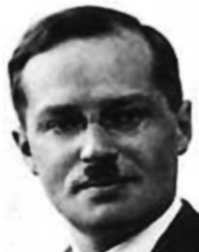
Jerzy NEYMAN (SPŁAWA) (1894–1981)